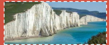
Chalk cliffs at Seven Sisters, Dover, UK

Hard water areas get groundwater from chalk or limestone rocks.